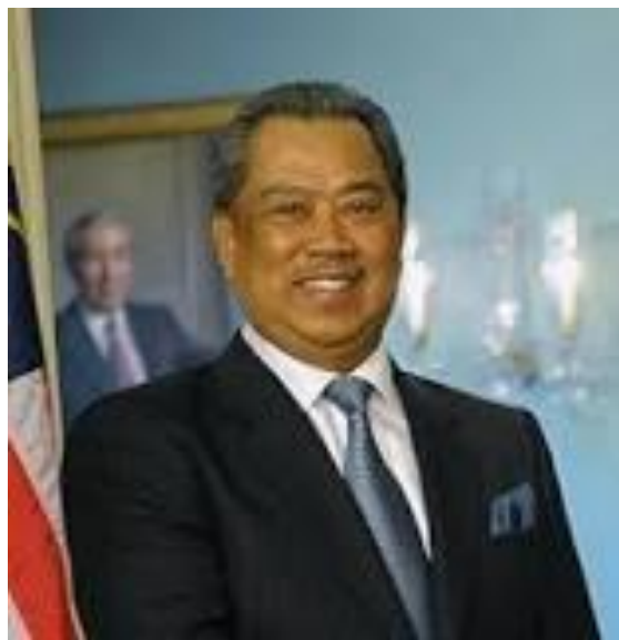
YB TAN SRI DATO' HAJI MUHYIDDIN YASSIN MINISTER OF HOME AFFAIRS MALAYSIA